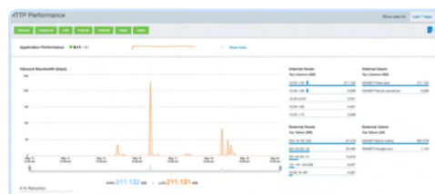
Purpose built reports